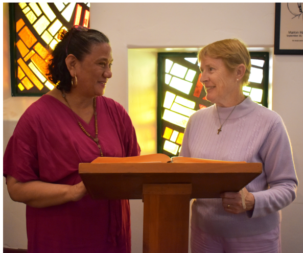
Chaplaincy provides spiritual support to clients through interfaith services and support groups.

“ I am so thankful for the things that happened through Father Joe's. I just want to stress how much goodness is in this place. You can improve your life if you take advantage of the programs here.