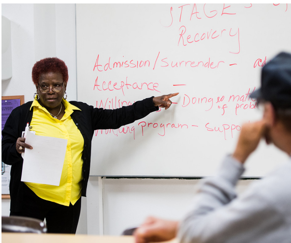
Our Addiction Treatment and Education Center works with clients in groups and individually to help them reach their recovery goals.