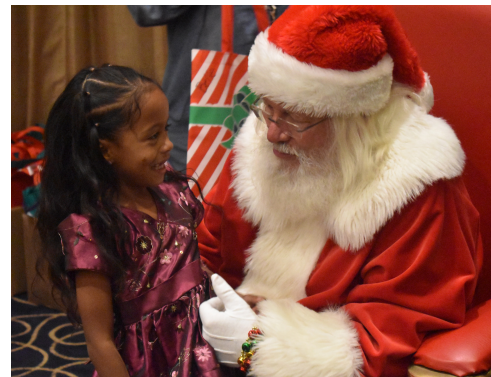
At the annual Children's Christmas Party, each child is given special attention and gifts from Santa.